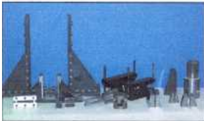
Miscellaneous Test Fixtures