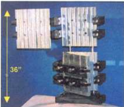
Large Notch Compression Test Fixture

Intec's diverse testing capabilities have required us to build a large variety of test fixturing. Purchasing standard test fixtures from traditional sources usually requires a substantial investment, and Intec has historically avoided paying the going rate by machining our own fixturing. With our expanded machining capabilities, we are offering these services to our clients at rates far below industry standard pricing. Intec has manufactured fixtures for standard tests including: Compression ASTM D695, D3410, SACMA 1 and 6, Iosipescu ASTM D5379, CAI and Impact NASA 1090, BSS 7260, Flexure ASTM D790, C393, Rail