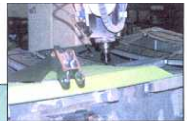
5 Axis Complex Trim Detail