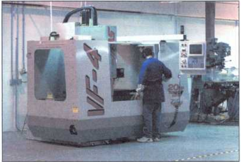
HAAS VF4 50” x 20” 4 Axis Machining Center

Intec has been employing engineering co-op students from the University of British Columbia since the spring of '97. This has been beneficial for Intec as well as the students who are bright, enthusiastic, energetic, and interested in learning the technical challenges continually present in the engineering field. Following the UBC Co-op office slogan “Hire Education”, Intec has hired 3 students to date who have all been Metals and Materials Engineering majors fulfilling an 8 month work term requirement. Engineering students who sign up for the coop program take a minimum of 5 years to receive their degree as they are required to participate in three work terms of 4 months each, and one 8 month work term. While the students earn additional money to help fund their education, they find their work terms very educational in terms of “what an engineer really does”, this in turn is helpful for them in defining their career goals. Engineering students recognize the importance of the co-op experience as 50% of all first year engineering students at UBC apply for the Co-op program.